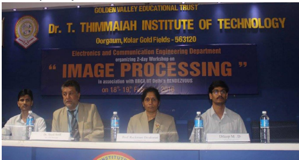
Principal and HOD, ECE with the Resource person on IP workshop