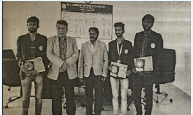
Competition winners along with Mining HoD and Principal