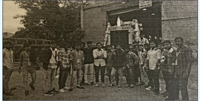
Mining Department Students visited BEML, KGF

Department of Mining Engineering arranged one day industrial visit to BEML factory at KGF for 5th semester students on 21st September, 2019. Objective of the visit was to provide closer look into Mine Machineries which are manufactured in BEML, KGF