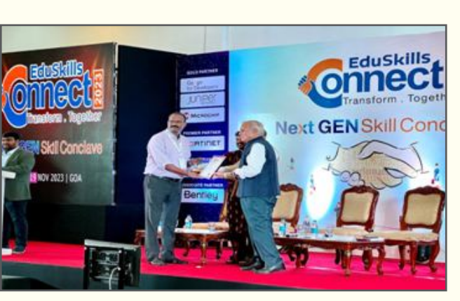
Placement & Corporate Head receives Honors

These accolades were received at the Eduskills Connect 2023 event held in Goa from 17th to 19th November 2023.