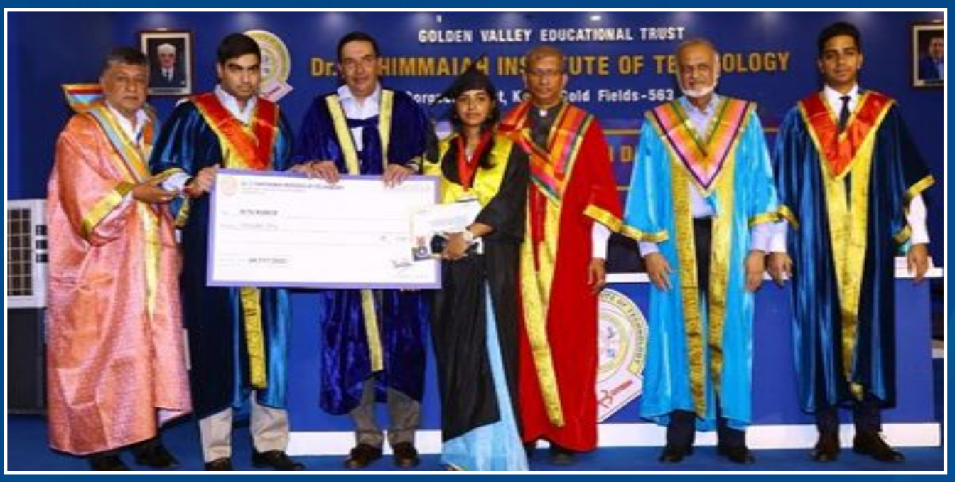
College toppers receiving 1 Lakh cheque