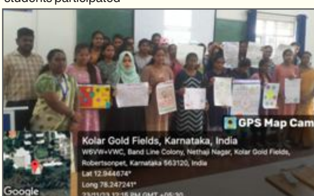
Students participated in poster making competition

Poster making competition was organized on 23rd Nov 2023 on the account of National Entrepreneurs Day.120 students participated