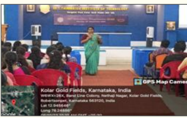
Session on Problem Solving & Ideation