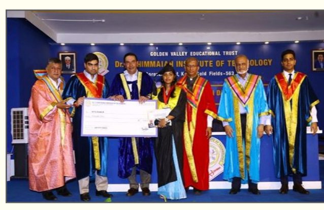
College toppers receiving 1 Lakh cheque