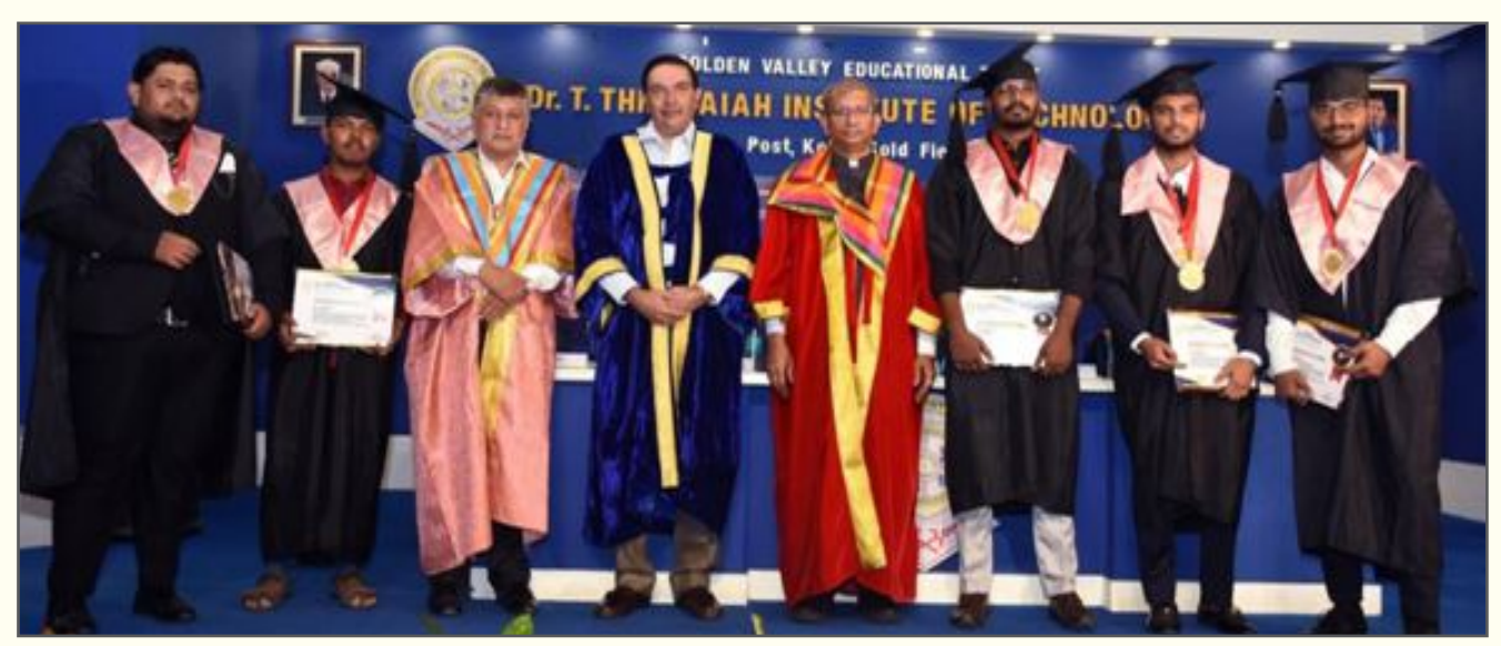
2019-23 Batch toppers on Graduation Day