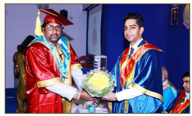
The dignitaries welcomed by the HODs