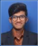
DHANUSH N TATA Consultancy Services