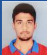
ADNAN SM Amazon