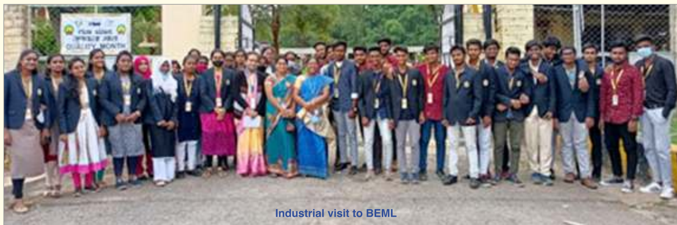
Industrial visit to BEML