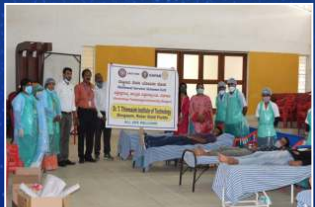
Blood donation camp was organized by NSS