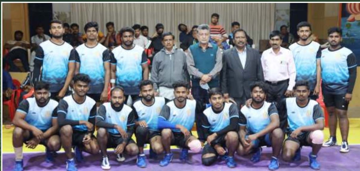
Dr.TTIT Team Participating in VTU North Zone Kabaddi Tournament 2021

VTU kabaddi team camp was organised by Dr. TTIT on 18th to 21st December 2021