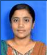
GANGOTHRI KR Capgemini