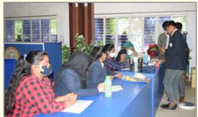
Blood donation camp was organized by NSS