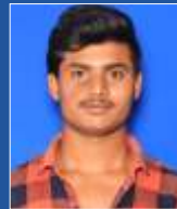
VENKATESH A Klok systems India Pvt Ltd