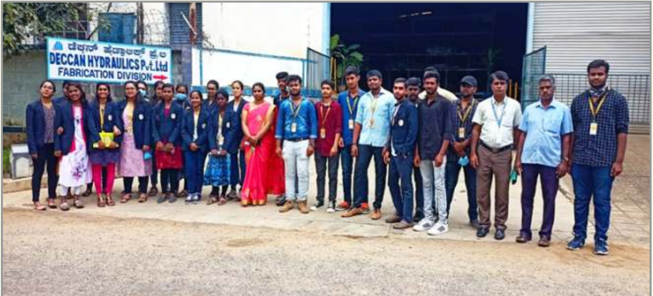
Industrial visit to Deccan Hydraulics