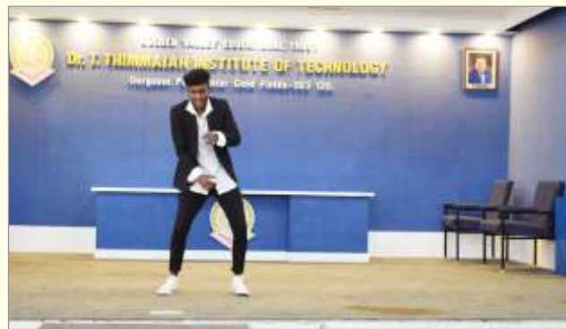
Solo Dance competition