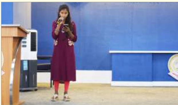
Solo Singing competition