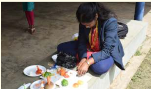
Vegetable carving competition