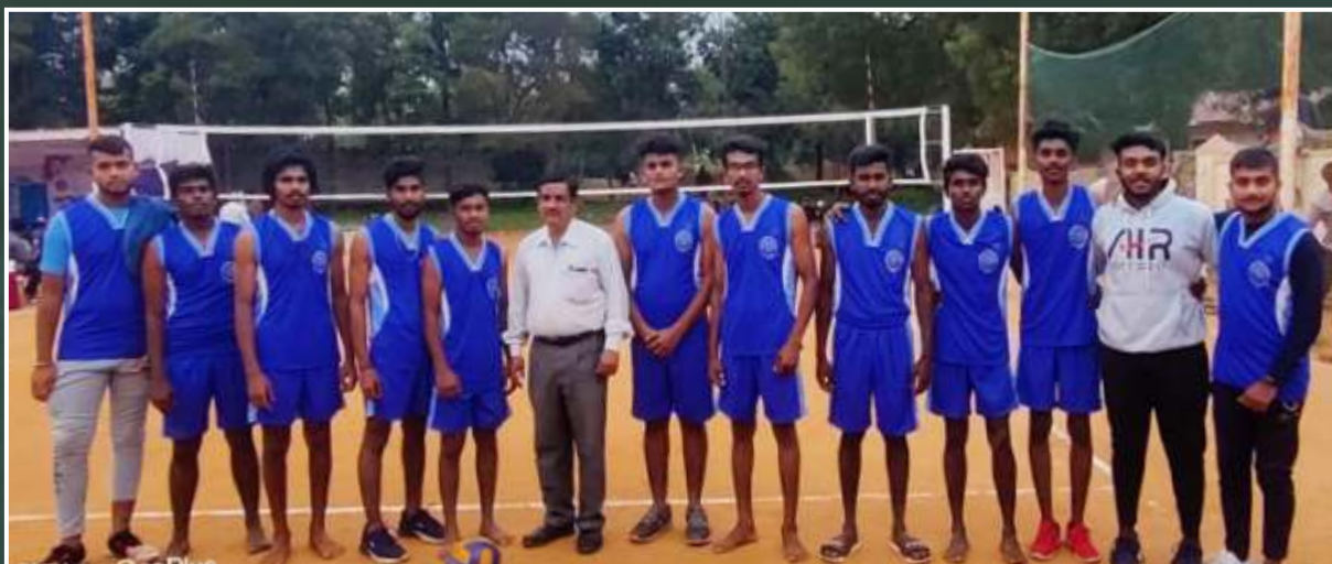
Our college Volley ball team along with Physical Director

Our college Volley ball team entered into VTU North zone semifinals held at SJCIT, Chikkaballapur on 28th & 29th November 2021