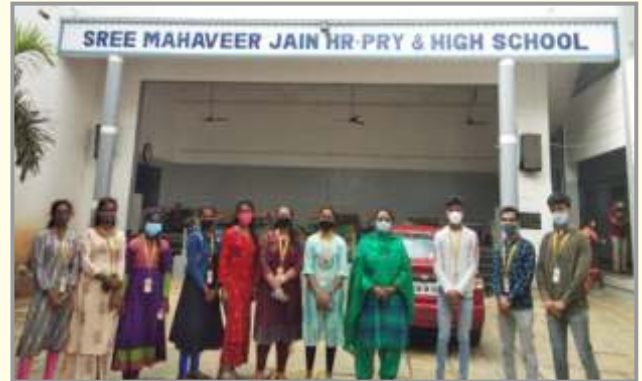
Youth For Seva (YFS) Volunteers at Shree Mahaveer Jain High School, K.G.F

Blood Donation camp was organized on 6th August 2021 at our college campus in association with Government General Hospital, Blood Bank, K.G.F and collected 14 units of Blood sactets.