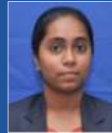
NATASHATHRA P RESH Solution