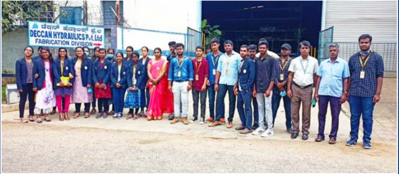
Industrial Visit to Deccan Hydraulics