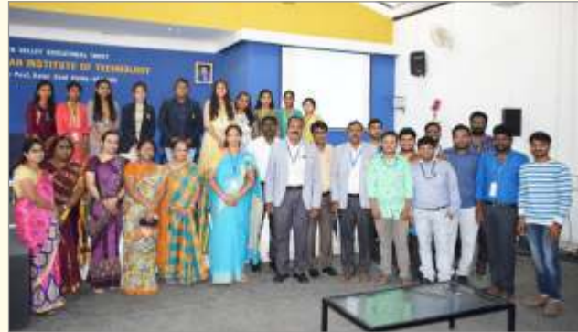
ECE and EEE HODs along with faculty and student coordinators