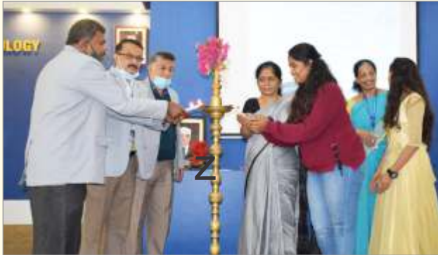
Lighting of the lamp by the dignitaries and students

The Departments of ECE & EEE with the sponsorship of IETE organized "TECHNICAL & CULTURAL HACKATHON" on 30-10-2021.